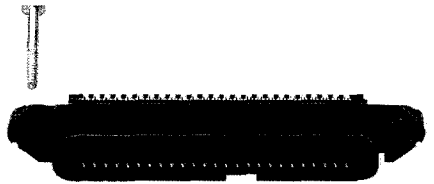
Screw Lock Hardware Kit Part Number 229911-1 (Two required per assembly)

Only fastening hardware supplied, other items shown for reference purposes.