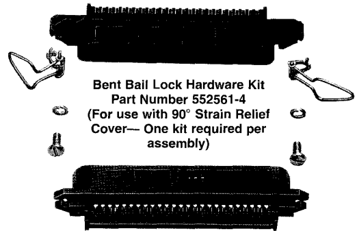
Bent Bail Lock Hardware Kit Part Number 552561-4 (For use with 90° Strain Relief Cover— One kit required per assembly)